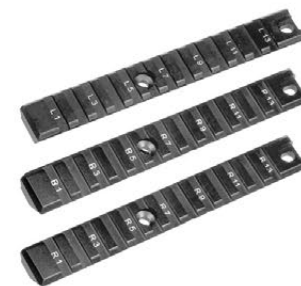
Three 6.08" Length Rails with 13 Picatinny Slots