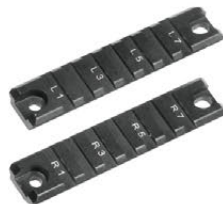
Two 3.87" Length Rails with 7 Picatinny Slots