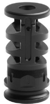
.223/5.56 | 1/2"X28 ■ / TLUMD01