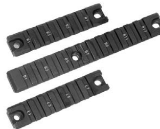
One 6.08" Length Rail with 13 Picatinny Slots and Two 3.87" Length Rails with 7 Picatinny Slots