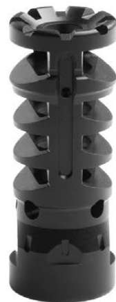
.223/5.56 | 1/2"X28 ■ / TLUMD02