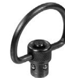
1.29" C-SHAPE LOOP