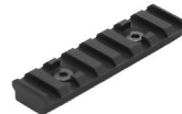
8-slot / MTURS09M