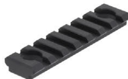
7-slot / MTURS10M