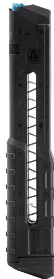
9MM | 33 ROUND | WINDOWED