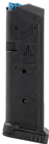
9MM | 15 ROUND