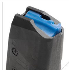
High Contrast Blue Anti-tilt Follower