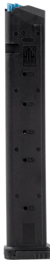
9MM | 33 ROUND