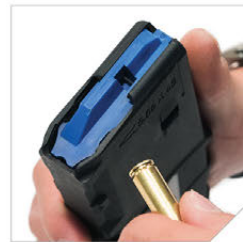
Four-way Anti-tilt High Visibility Blue Follower and High Longevity Stainless Steel Spring for Reliable Feeding