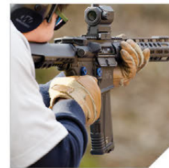
Fully Automatic Torture Tested