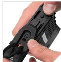
Removable Flared Floor Plate