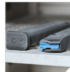
Adverse Temperature Tested