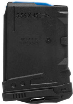
5.56 | 10 ROUND ■ / RBT-AM10