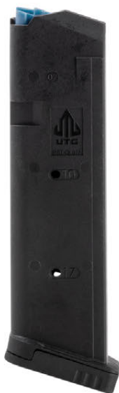
9MM | 17 ROUND