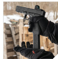
Live Fire Torture Tested