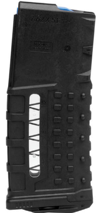
.308 | 25 ROUND | WINDOWED ■ / RBT-DM25