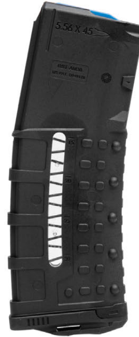
5.56 | 30 ROUND | WINDOWED ■ / RBT-AM30 ■ / RBT-AM30D [NEW]