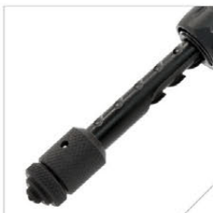
Height Adjustable Spiral Guided 7075-T6 Aluminum Leg Extensions with Automatic Leg Extension Retraction (US PAT. 10323897)