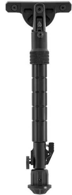
RECON FLEX® II

M-LOK® / 7.1" - 9.1" Center Height / TL-BPDM03 M-LOK® / 8.7" - 12.0" Center Height / TL-BPDM04