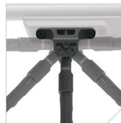
5 Position Bidirectional Folding Legs