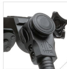
Oversized Posi-lock Push Buttons for Easier Use while Wearing Gloves