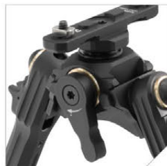
Tension Adjustable 360° Panning & 19° Tilt Forward, Rearward, Left, and Right