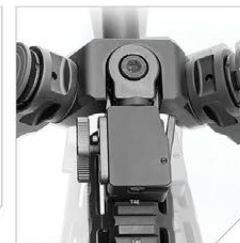
Tension Adjustable 44° Left & Right Tilt