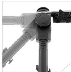
0°, 45°, & 90° Folding Leg Positions with Steel-on-steel Lockup