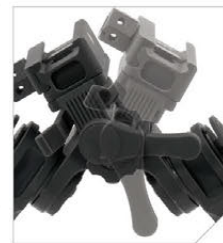
Tension Adjustable 35° Panning and 55° Left and Right Tilt