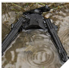
Performance Tested and Evaluated