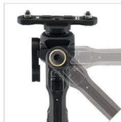
0°, 45°, & 90° Folding Leg Positions with Steel-on-steel Lockup