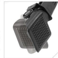
Rotatable Footpads Self Adjust to Uneven Surfaces and Bipod Leg Positioning