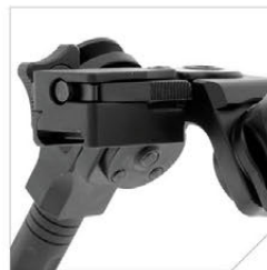
Quick Detachable Mounting Base (Designed to Mount Under or Over Rifle Bore)

7.3" - 11.4" Center Height / TL-BPOB01-A