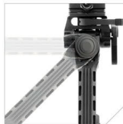
0°, 45°, & 90° Folding Leg Positions with Steel-on-steel Lockup

9.4" - 14.0" Center Height / TL-BPFS01-A