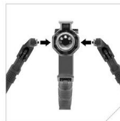
Directly Attaches to Handguard at the 3 and 9 O'clock Positions